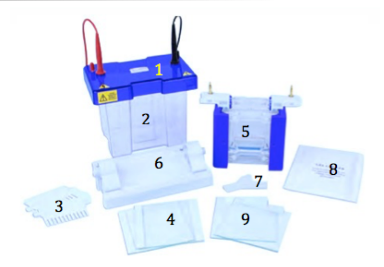
1 Lid 2 Tank 3 Combs 4 Plain glass plates with bonded spacers 5 PAGE insert 6 Caster 7 Gel release tool 8 Freezer pack 9 Notched glass plates